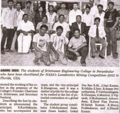
பொன்புலர் சீனிவாசன் பொறியியல் கல்லூரியில் உள்ள மாணவர்கள்.

Among 60 institutions worldwide and eight national teams, the team from Srinivasan Engineering College in Perambalur has been shortlisted for the NASA's Lunabotix Mini Competition-2012 in Florida, USA.