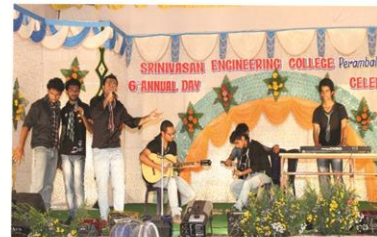
Light Music Performance by the students