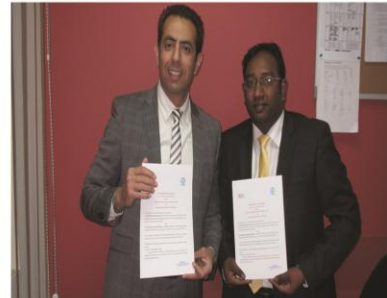
MOU with Canadian International college, Egypt