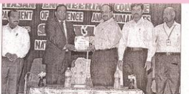
பொன்புலர் சீனிவாசன் பொறியியல் கல்லூரியில் உள்ள மாணவர்கள்.