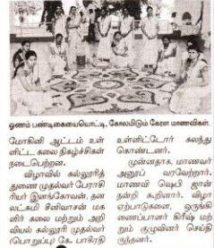
பொன்புலர் சீனிவாசன் பொறியியல் கல்லூரி சிறப்பாக சாதிப்பதற்காக பல்வேறு முயற்சியும் கொண்டுவந்தது.