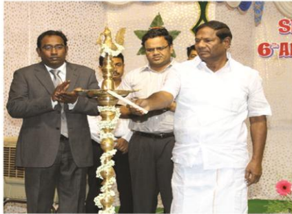
6th Annual day programme