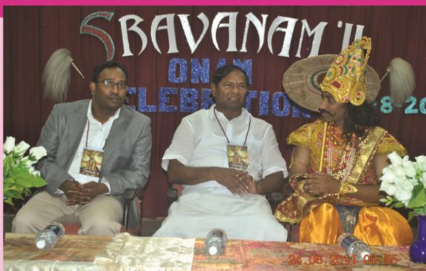
ONAM Celebration, held at SEC, Founder – Chairman exchanging a word with a student dressed like the legend king Mahabali

Onam, one of the most celebrated festivals of Kerala, was celebrated in our college (on 26th August 2011) with equal gloire and gaily that one naturally finds in God's own country, Kerala. The festival that mythologically marks the promised return of the legend king Mahabali to the inhabitants of his kingdom, Presently Kerala was dramatically impersonated by students dressing alike (the great king) Mahabali who then, distributed sweets to all faculty and students.