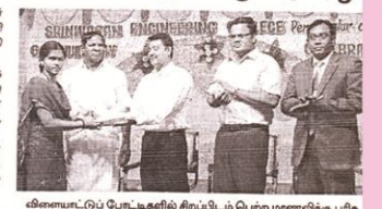
பொன்புலர் சீனிவாசன் பொறியியல் கல்லூரியில் ஆண்டு விழா நடைபெற்றது.

பொன்புலர் சீனிவாசன் பொறியியல் கல்லூரியில் ஆண்டு விழா நடைபெற்றது. மாணவர்கள் கருத்துரை செய்தனர்.