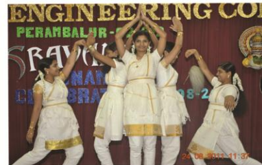
Mind blowing dance performance