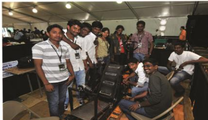
Lubanotics participants in NASA at USA