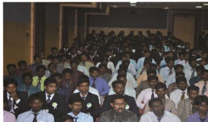
Careful listening to the Training programme.