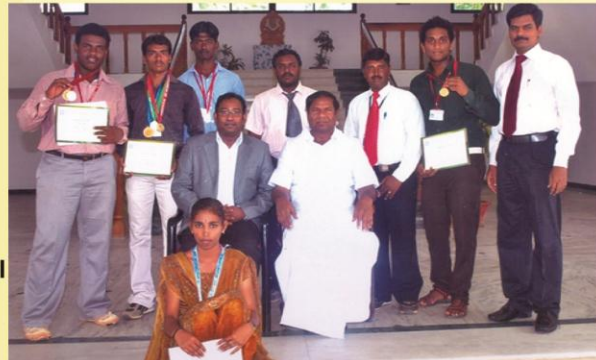
The Winners of Zonal Level Competitions displaying their model and certificates, with the founder – Chairman and Principal