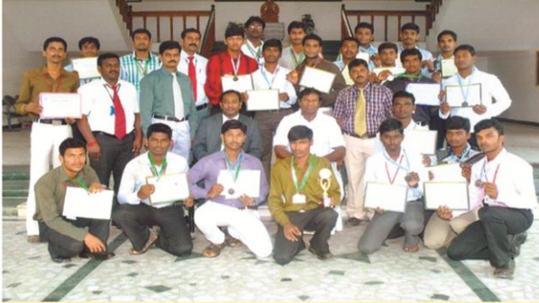
Anna University, Trichy Zonal Level athletic meet prize winners

Anna university zonal level ball badminton runners team & Cricket team-third place-zonal level.