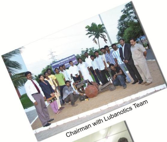
Chairman with Lubanotics Team