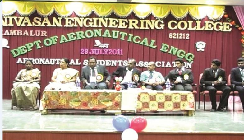
Inauguration of Students Association