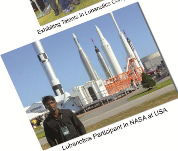
Lubanotics Participant in NASA at USA

Fourteen students from the Srinivasan Engineering College, Perambalur, would participate in the Lunabotic Mining Competition 2012, to be organized by The National Aeronautic and Space Administration (NASA), at the Kennedy Space Research Centre from May 21 to 26 this month.