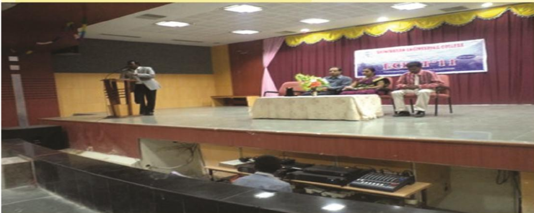
Dr.B.Karthikeyan, having a word wish the students at EFUGEN - 11

The Department of ECE, Organized a two days workshop PCB Design using ORCAD on 30 and 31st January 2012 in the college Auditorium. The Forenoon session consisted of presentation on PCB designing and the basics of ORCAD. In the afternoon session Hands on Experience of CB Laying and Etching were provided to the students.