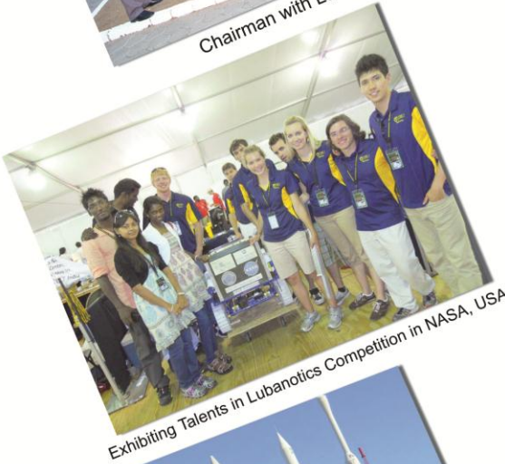
Exhibiting Talents in Lubanotics Competition in NASA, USA